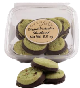
DIPPED PISTACHIO SHORTBREAD

ITEM CODE RP SB102-8OZ UPC 81792502124 5 NET WT. 8.0 oz