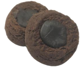
CHOCOLATE THUMBPRINT APPROX PCS/CASE