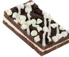
Classic Cookie 12 / 21 / 78