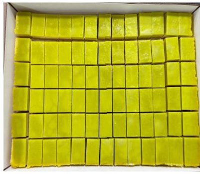
78 Pack Case 1.25 x 2" (App. 1.0oz)