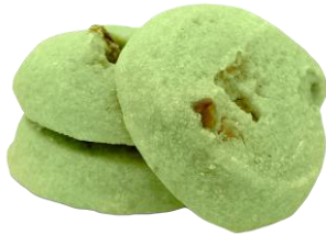
PISTACHIO SHORTBREAD APPROX PCS/CASE