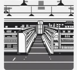
Supermarkets & Micro markets