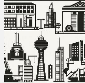
Business & Industry