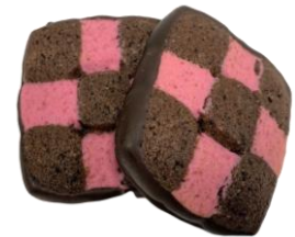
DIPPED RASPBERRY CHECKBOARD APPROX PCS/CASE