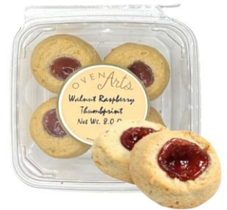
WALNUT RASPBERRY THUMBPRINT

ITEM CODE RP TP102-8OZ UPC 81792502070 5 NET WT. 8.0 oz