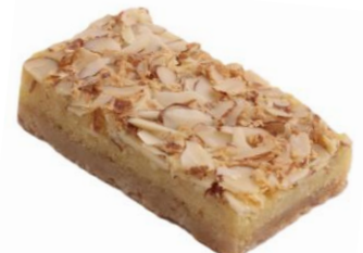
Almond Frangipane 12 / 78