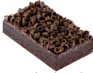
Classic Fudge 12 / 21 / 78