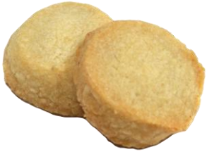
VANILLA SHORTBREAD APPROX PCS/CASE