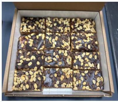
12 Pack or 21 Pack Case 2.75 x 4" (App. 4.0oz)