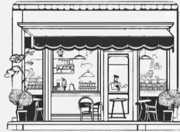
Cafes & Bistros

OUR MISSION To delight our customers by creating, baking and sourcing the best desserts and baked goods using high quality ingredients in an environment of respect to our people and processes and with a commitment to innovation and continuous improvement.