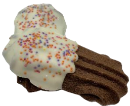
CHOCOLATE RAINBOW FINGER APPROX PCS/CASE