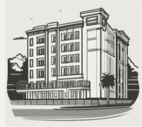
Hotels & Restaurants