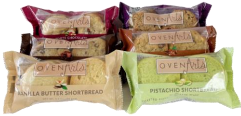
MINI PACK COOKIES