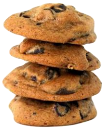
CHOCOLATE CHUNK APPROX PCS/CASE