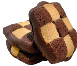
DIPPED CHECKERBOARD APPROX PCS/CASE