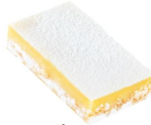
Lemon 12 / 21 / 78