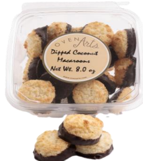
DIPPED COCONUT MACAROONS

ITEM CODE RP LACE102-8OZ UPC 81792502081 1 NET WT. 8.0 oz