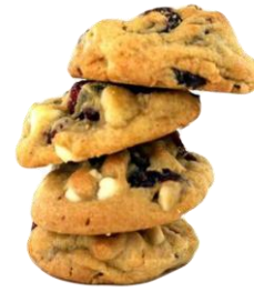
WHITE CHOCOLATE CRANBERRY MACADAMIA APPROX PCS/CASE