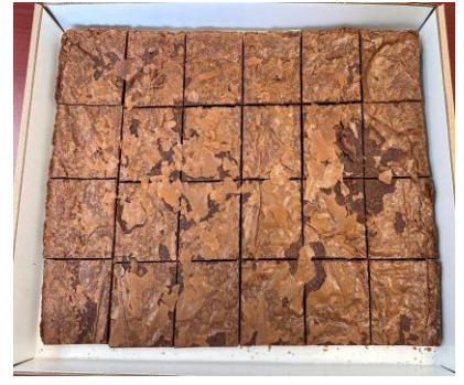
24 Pack Case 2.75 x 2.75" (App. 3.0oz)