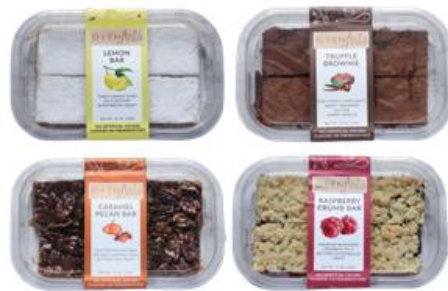
BROWNIE & BAR TUBS