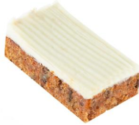
Carrot Cake 12