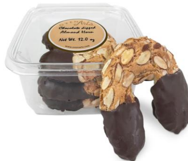
DIPPED ALMOND HORN

ITEM CODE RP CRSPSW101-8OZ UPC 81792502093 4 NET WT. 8.0.0 oz