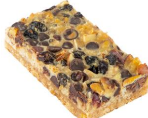
Coconut Magic 12 / 21 / 78