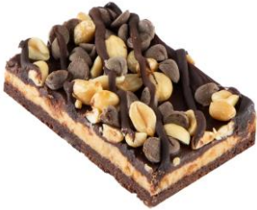
Peanut Butter 12 / 21 / 78