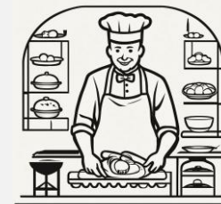
Food Service & Caterers