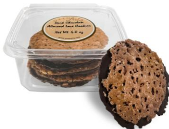
MILK CHOCOLATE LACE

ITEM CODE RP SPL104-8OZ UPC 81792502132 0 NET WT. 8.0 oz