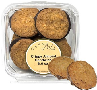
CRISPY ALMOND SANDWICH

ITEM CODE RP TP103-8OZ UPC 81792502071 2 NET WT. 8.0 oz