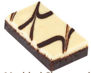
Marbled Cheesecake 12