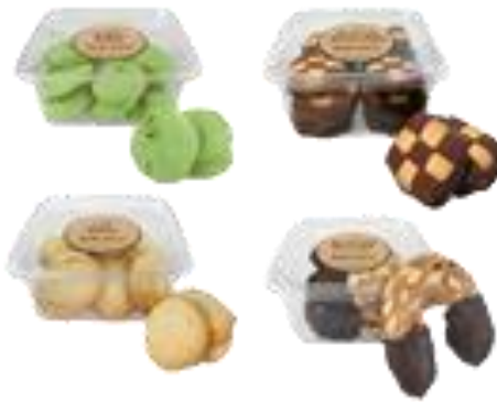
SPECIALTY COOKIE TUBS