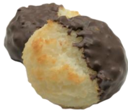
DIPPED COCONUT MACAROON APPROX PCS/CASE