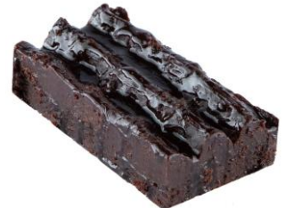
Mississippi Mud 12 / 21