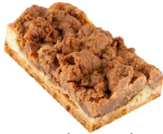
Apple Crumb 12 / 21