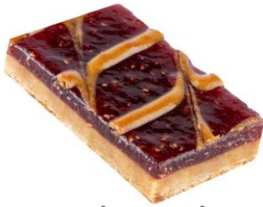
Raspberry Linzer 12 / 21 / 78