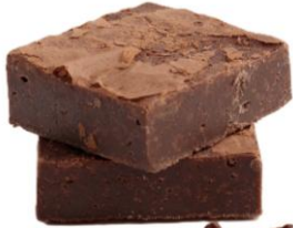
Truffle Brownie 24 / 78