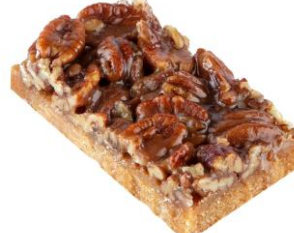
Caramel Pecan 12 / 21 / 78