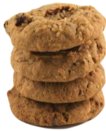
OATMEAL RAISIN SPICE APPROX PCS/CASE