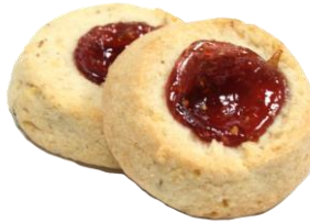
WALNUT RASPBERRY THUMBPRINT APPROX PCS/CASE