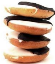
BLACK & WHITE APPROX PCS/CASE