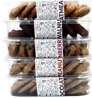
GOURMET COOKIE TUBS